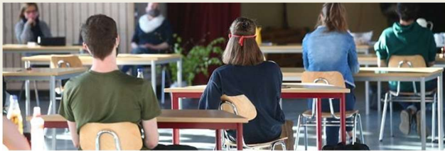
Going to school in Corona - times