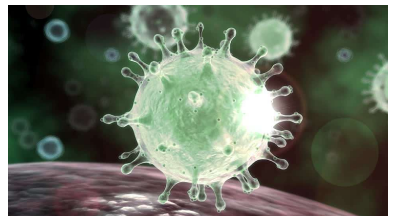
The pandemic has forced us to stay home. But, what will happen next?

All in all, everybody has to reorient themselves when the schools reopen, after the Corona crisis. It isn't an easy time for teachers and students. Definitely, it's very difficult. In Corona – Times, everybody has to stick together, but also make sure that they don't destroy their own future. The chances in school life are so important for students. Because of this situation now, many discussions are taking place online. Be part of those discussions! With good language skills, you are able to discuss those important topics on an international level. After all, this pandemic affects everyone in this world in some way. Stay connected, communicate and use your time wisely and start learning a foreign language now!