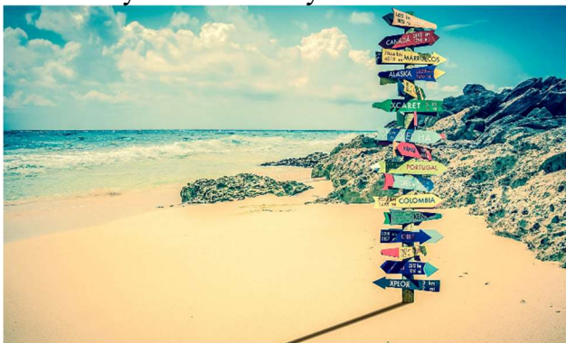
Language learning is important to travel – Important to communicate

The Corona lockdown has resulted in boredom for many people and especially some of the younger ones don't feel the need to use their time effectively. They took the day as it came and allowed home schooling to let slip. But we know from different studies that especially foreign languages need to be practiced on a regular basis in order to make progress, and what is even more important, to not regress regarding the language skills that you have already achieved.